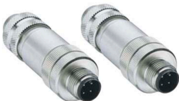
Part no.: 426128 AC-MLC-END Connector set