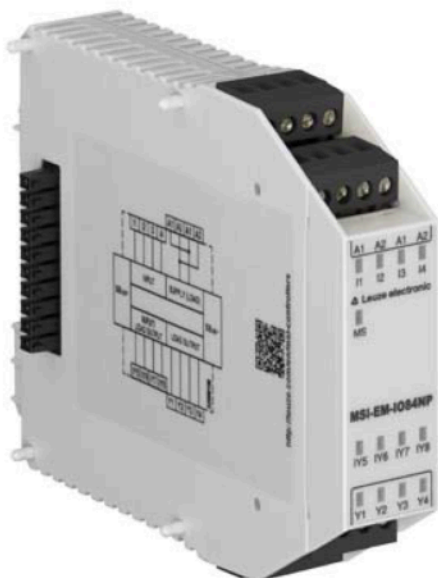
Part no.: 50132998 MSI-EM-IO84NP-03 Non-safe I/O module